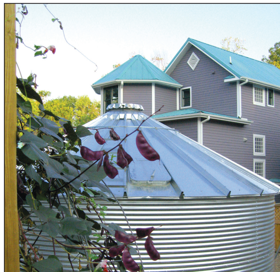
Neighborhood Cistern in Pacifica

FREE low-flow showerheads for OWASA customers