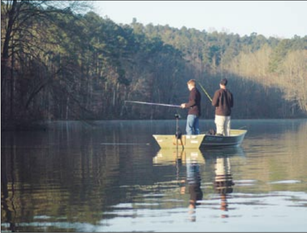
A duo tests its luck during the third annual bass fishing competition between Duke University and UNC. Eighteen fishers drove out to University Lake in Chapel Hill for the Sunday morning event.