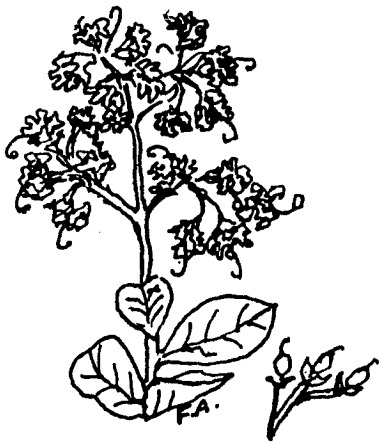
CRAPE MYRTLE (LAGERSTROEMIA INDICA)