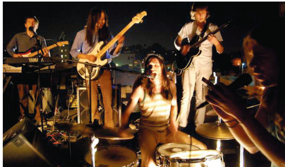
ARIEL PINK'S HAUNTED GRAFFITI 8/3 LOCAL 506

With Combat Zone, Change the Station and The Heron. You know Reservoir shows rock. Hard. 10pm