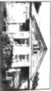
ST. LUKE SENIOR CENTER 1100 W. 10th Street, St. Louis, MO