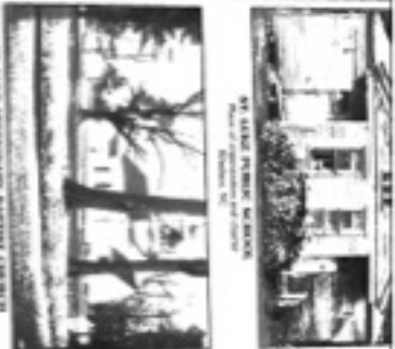
97 EAST PARKWOOD MOBILE HOME