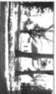
ST. LUKE RETIREMENT CENTER 1100 W. 10th Street, St. Louis, MO