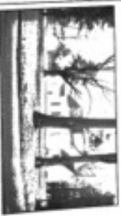
ST. LUKE COMMUNITY CENTER 1123 GOVERNORS RD., WENDOC, NC