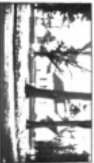
ST. LUKES MEMORIAL BAPTIST CHURCH 1000 W. 10th St. Greenville, SC