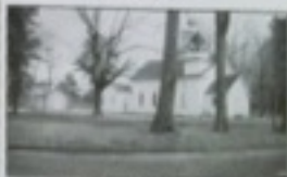
60 LYNN MANASSAS BAPTIST CHURCH (Part of headquarters) Winston, NC