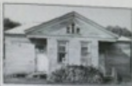
60 LYNN PUBLIC SQUARE (Part of headquarters with office) Winston, NC