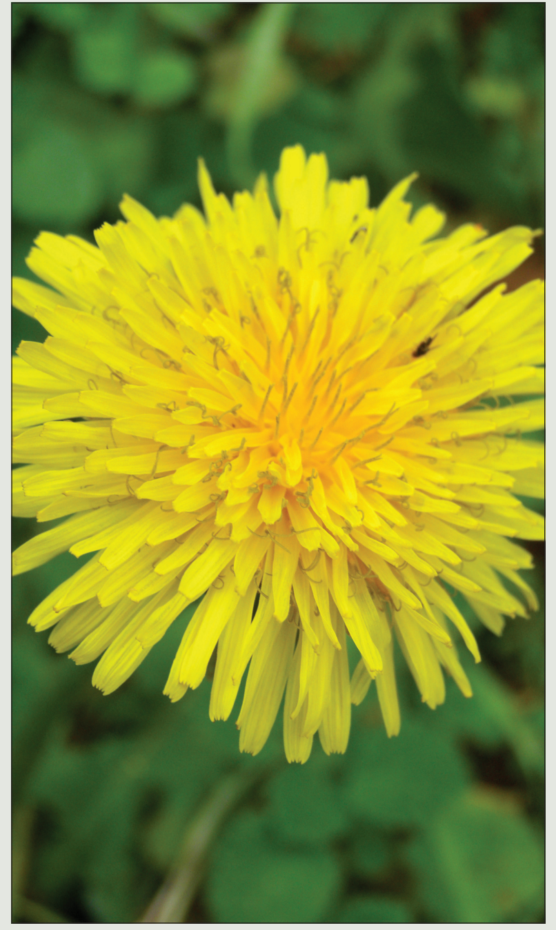
Dandelion flower head holds 100-plus ray flowers.

12 THURSDAY, FEBRUARY 9, 2012 THE CARRBORO CITIZEN