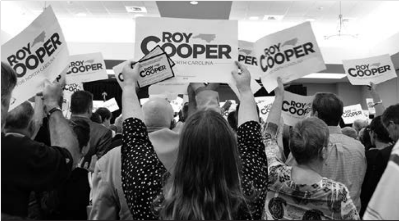
Students and members of the community gather at Nash County Community College to see Attorney General Roy Cooper speak.