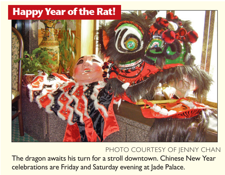
The dragon awaits his turn for a stroll downtown. Chinese New Year celebrations are Friday and Saturday evening at Jade Palace.

The primary will set the field for the November general election. Under the new county commissioner election rules, voters will select two commissioners from District 1, one from District 2 and one at-large candidate. The election will expand the board of commissioners from five to seven members. With the exception of a portion near Interstate 40 and Whitfield Road, the two new county districts mirror the two school systems' boundaries. The election map and the expansion of the board were approved by Orange County voters in a 2006 referendum. Rules for voting in the primaries and general elections are as follows: