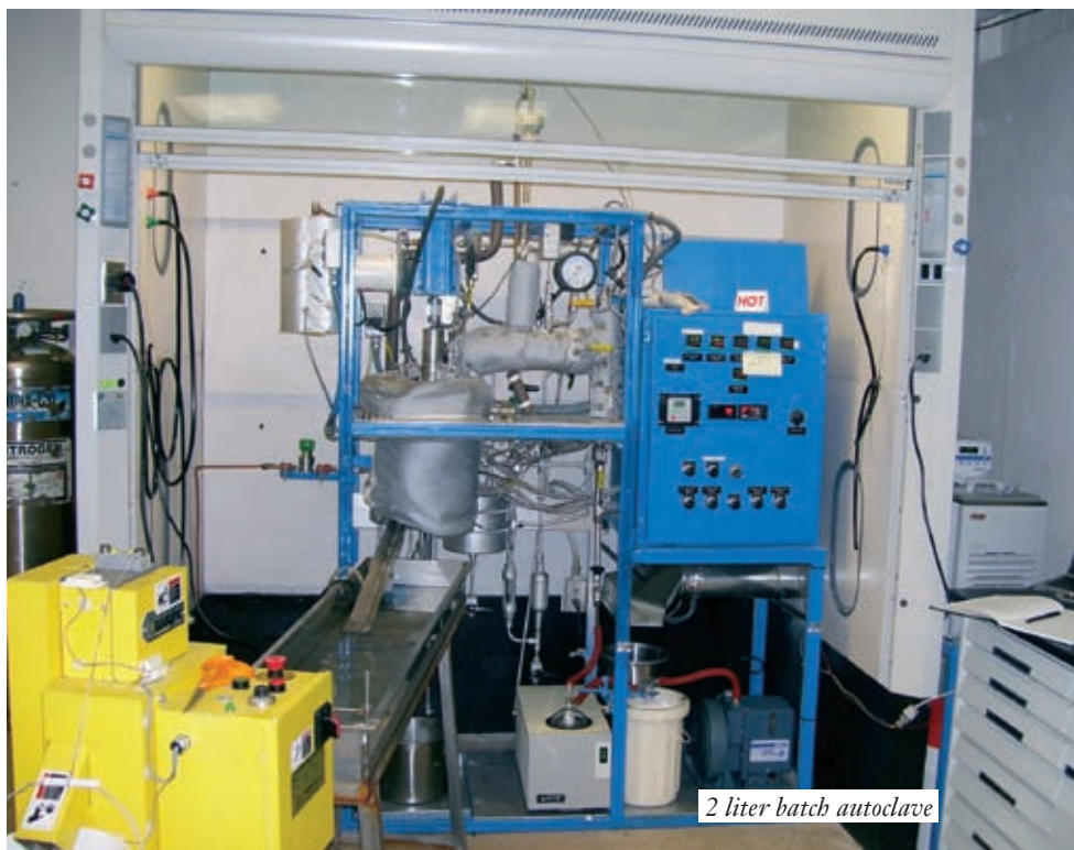
2 liter batch autoclave

The Center has a 2 liter batch autoclave (shown at right) which can polymerize raw materials in 1-2 pound batches. The autoclave is equipped with a chip cutter and water quench system. Charles Reid, the Center's Polymer technician, has a "can-do" attitude.