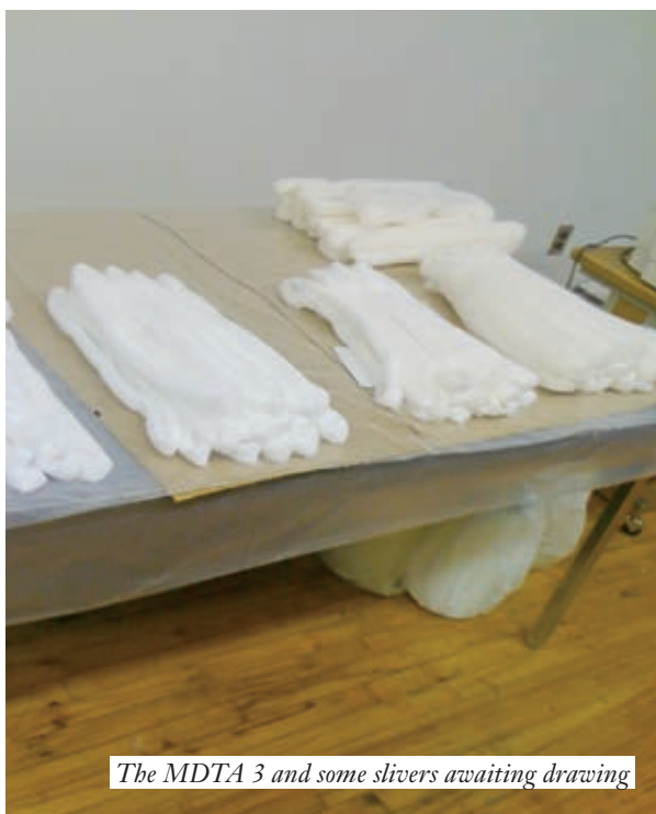
The MDTA 3 and some slivers awaiting drawing

He has assisted several innovators in creating new raw materials at the polymer level. Charles also has a vacuum oven, lab scale solid stating system, a sample film line and a monofilament spinner at his disposal to quickly turn polymer concepts into useable materials for further evaluation.