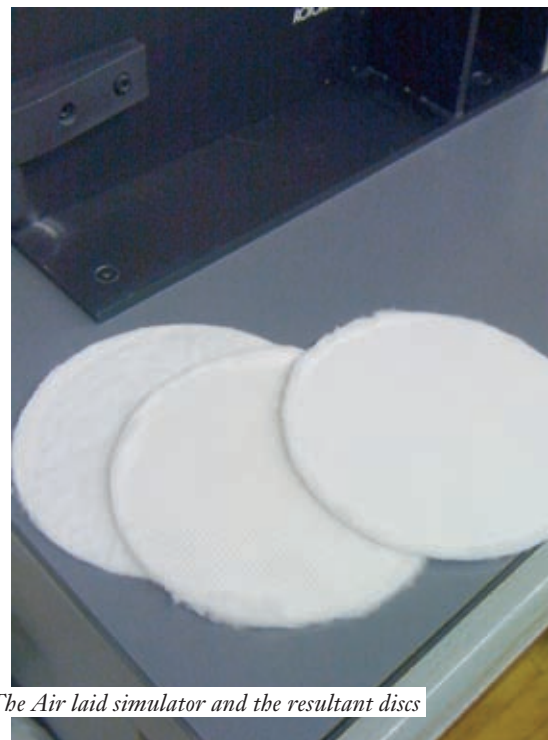
The Air laid simulator and the resultant discs