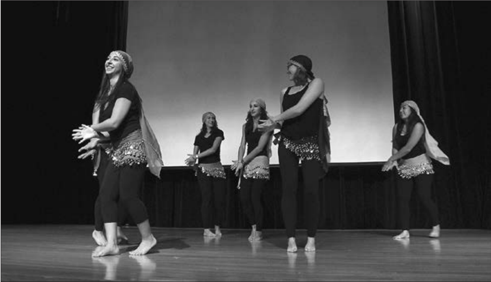
The Persian Cultural Society dance team performs at “1,001 Nights,” an event hosted by the society Thursday allowing students to explore Middle Eastern culture.