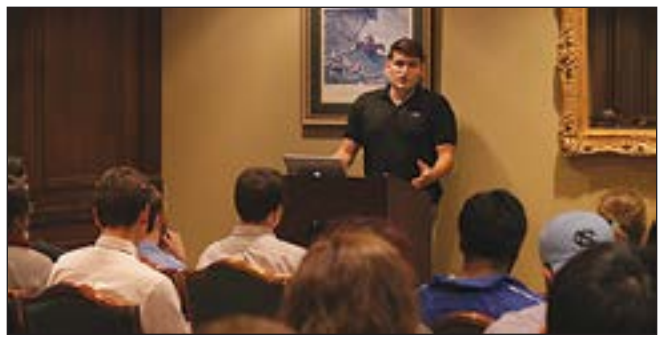
DTH/SAM SHAW Piasecki briefs Student Congress hopefuls on special election procedure. Students have one week to collect 20 signatures.