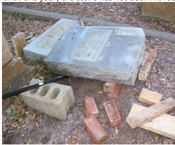
Beginning to rise up

Getting the stone back onto its base was one of this year's goals. Using steel straight bars and some concrete blocks, the stone was moved to its base and lifted off the ground.