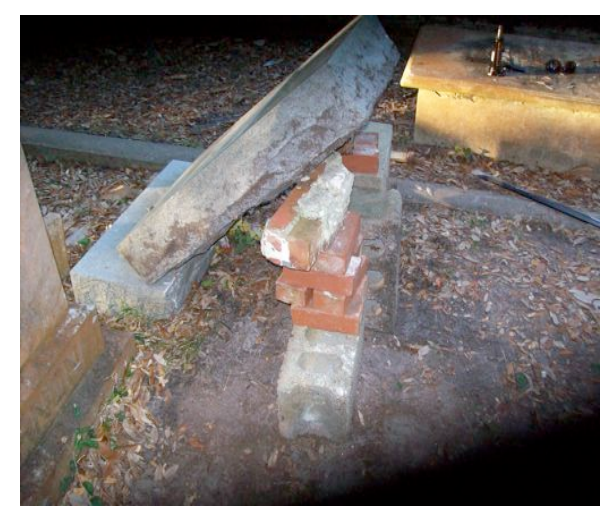
More work on stone

Using more time and more bricks, the stone was moved sufficiently so that a hydraulic car jack could be placed under the stone (about 650 pounds (estimated)) so that it could be pushed up and placed at a 45-degree angle on bricks and concrete blocks.