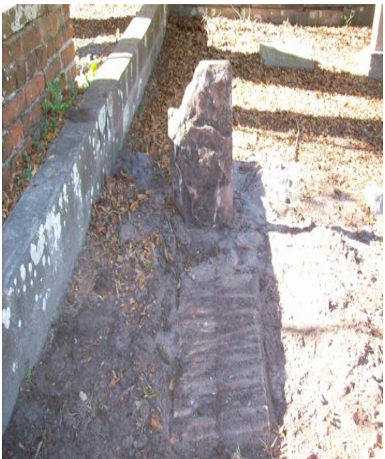
Upright to dry out

In December 2013, the stone was lifted up and reviewed. There are no words that can be found on either side of the stone. The size and shape of the stone indicate that it is a grave marker, but both ends are broken away with large chunks missing. Also found in the same area was a brick in the Carrier lot. It was unusual as it was under the soil/sand, and one could just see an outline. Upon uncovering it, there were more bricks on either side. Using a probe, the boundaries of the bricks were found and it appears that it is a small grave with a brick crypt. Since there was no grave where the red stone was buried, and the grave in the Carrier lot had no grave marking stone, the red stone was moved over to the brick covered grave and placed into the ground. Placing the stone upright will allow it to dry out somewhat and hopefully will slow down the decay. If any one knows about the red stone and where it should be please contact us. We need to know where it belongs and what name should on it.