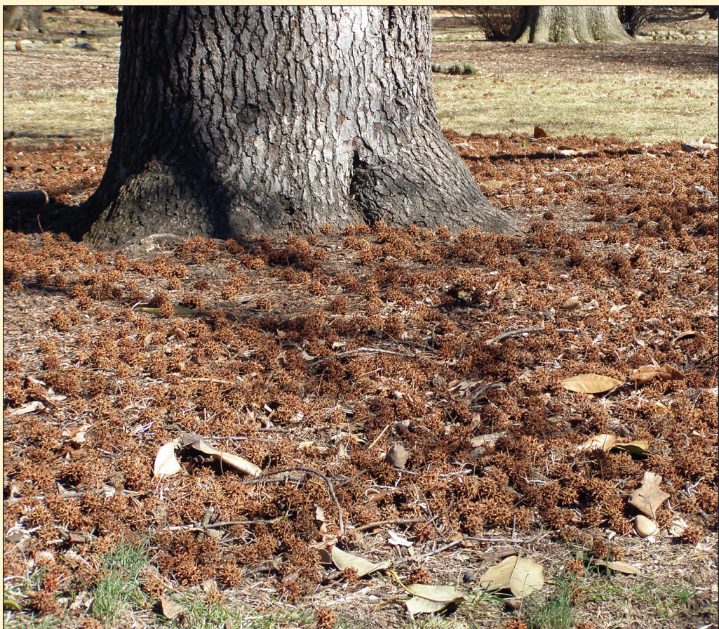
Sweet gum balls congregate as mulch beneath the big tree in Coker Arboretum.

Taking a lesson from nature, it seems so logical to let the gum balls lie where they fall, creating a natural mulch. Think about the natural forest. Each tree drops leaves that become natural mulch, which eventually decomposes to become nutrients for the roots. The wise and resourceful Botanical Garden staff at The Coker Arboretum leave gum balls to serve as mulch beneath that magnificent tree in the central lawn.