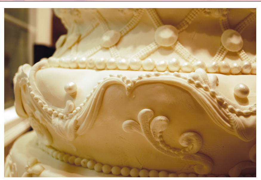
Details of a wedding cake being prepared by Miel Bon Bons in Carr Mill Mall