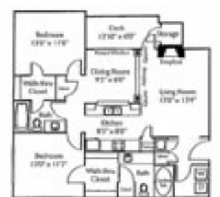
The Summit 2 Bedrooms / 2 Baths 1,122 Sq. Ft.

6123 Farrington Road Chapel Hill, NC 27517 far@shared.westdale.com