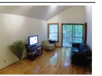
DOWNTOWN CARRBORO- Whispering Hills 3 Bedroom 1.5 Bath Townhome. Maple Floors, low utilities, Dishwasher/Disposal, Washer/ Drver included.

159,900. 919-260-1431 www.carrborohouse.com