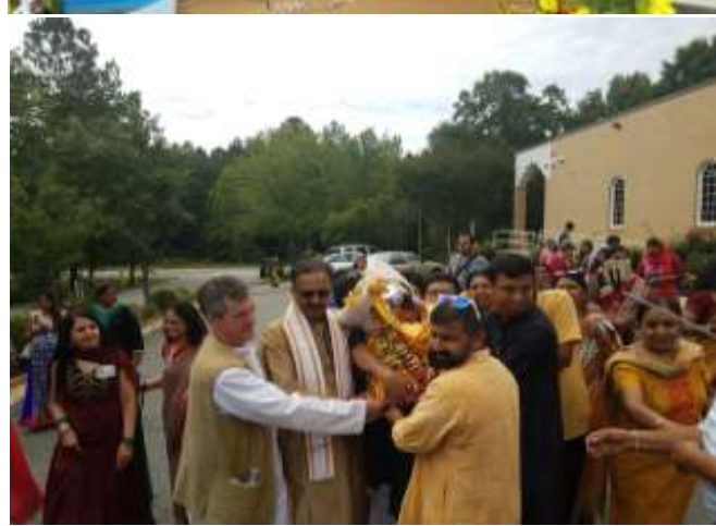
Mata Ki Chawki