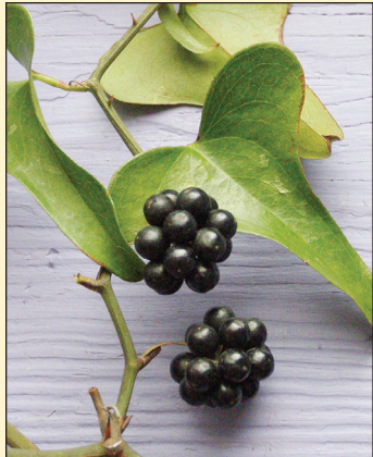
Black-berried, evergreen smilax makes long-lasting decoration.

round and heart-shaped leaves are attractive as the vines reach upward and outward in all directions. Some catbriers are not thorny and are attractive in flower arrangements. So there you have it; with thorns, or without, catbriers are vines of value and beauty to behold.