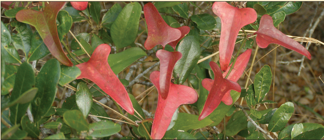
Catbriers often have a few red or burgundy cold season leaves.

Do you have an important old photo that you value? Send your 300 dpi scan to jock@email.unc.edu and include the story behind the picture. Because every picture tells a story. And its worth? A thousand words.