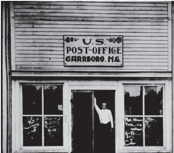
Carrboro's first post office, 1911

The 1st. P.O. in Carrboro was established in 1911. At that time, the place was known as Venable...the P.O. as Venable.