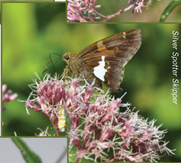
Silver Spotted Skipper