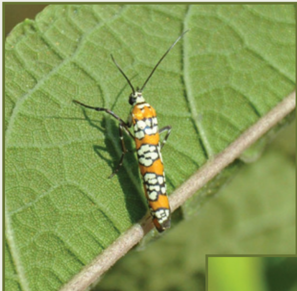
Ailanthus Webworm Moth