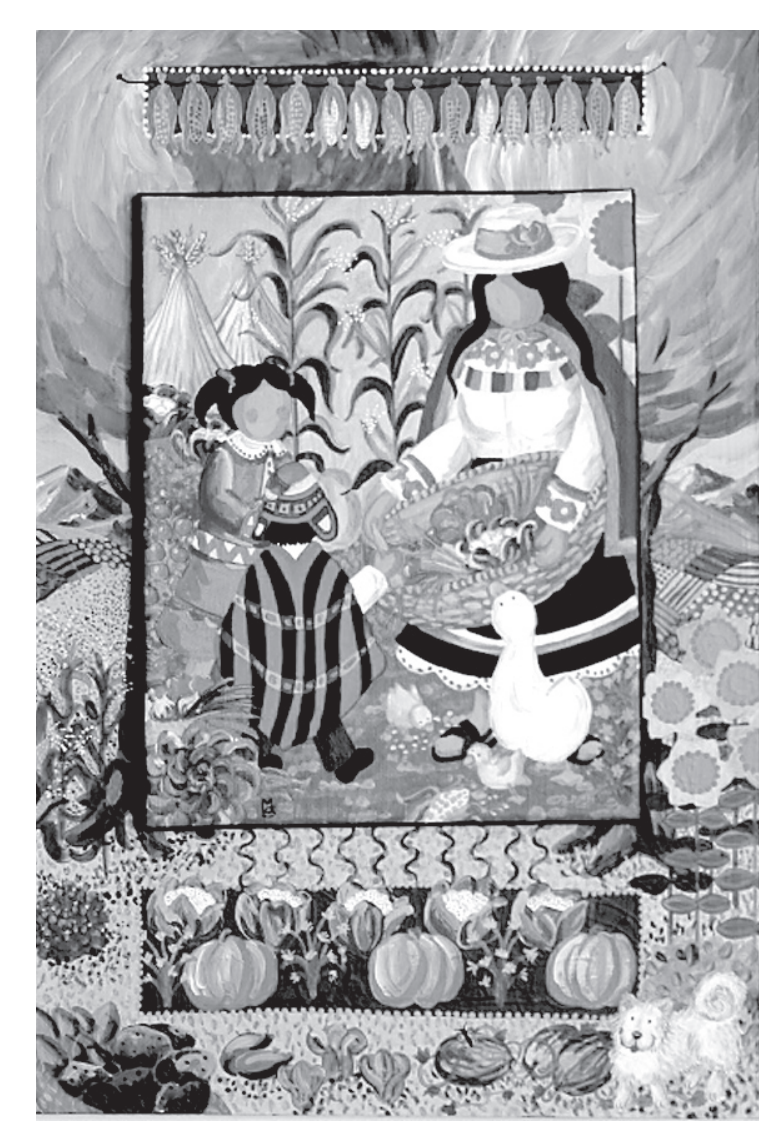
See "Primary Colors," Watercolor and acrylic by Miriam Sagasti at NC Crafts Gallery.