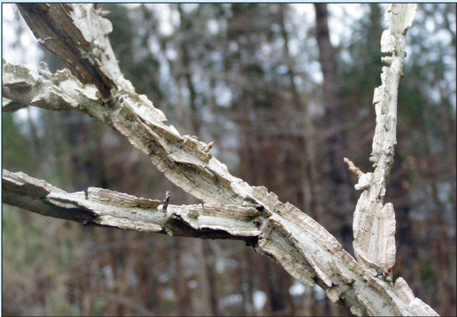
Irregular corky growth on Sweet Gum branch