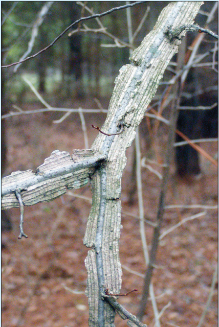
Flat corky Winged Elm branch

We mixed up the photos on Flora last week. For easy comparison, here are the Sweet Gum and the Winged Elm with the correct captions.