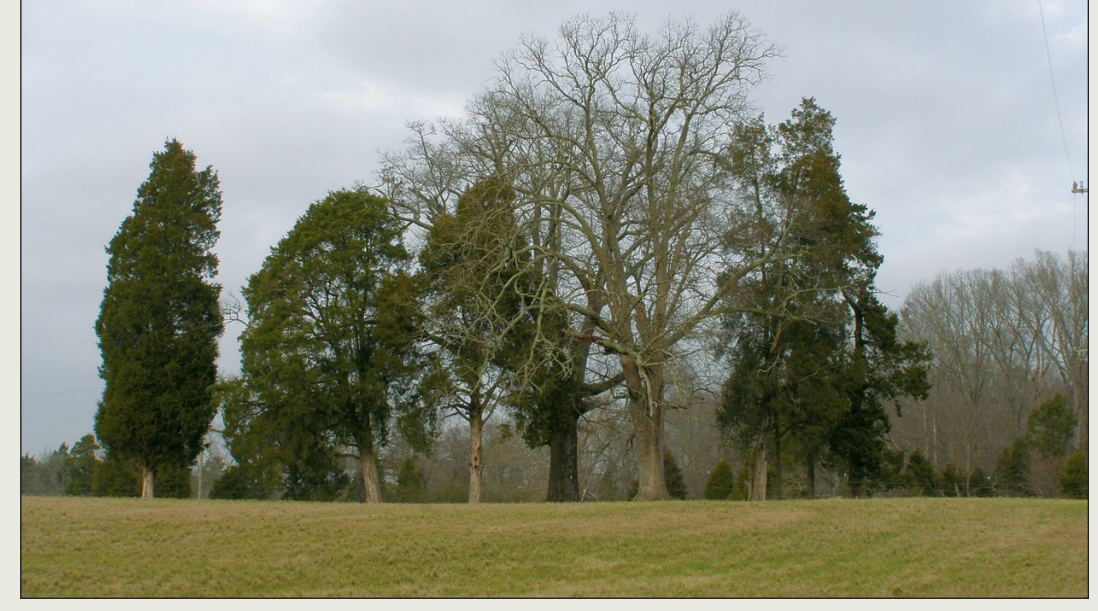
Coastal red cedar (left) never attains the height of the eastern red cedar (right).