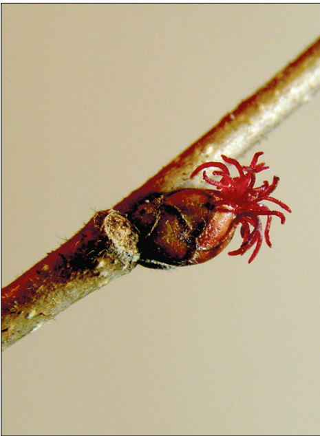
Female Hazelnut Flowers

is to spot clusters of what appear to be miniature pine cones. The little cones of the Tag Alder are generally one-half-inch long. They remain on the branches well into the second year. Your second challenge here, as with the hazelnut, is to locate the small swollen buds of the female flowers with red stigma threads reaching out for wind-borne Tag Alder pollen. Now you’re ready for your botany quiz. Why don’t these early-spring-flowering natives have showy petals? Reflect for a bit. Our early Piedmont springs are intermingled with our late Piedmont winters and native plants have devised clever strategies for success in the on-again, off-again cold weather. These plants don’t waste energy producing showy flowers to attract insect pollinators. Early-spring temperatures are too cold for significant insect activity, so these plants depend on the wind