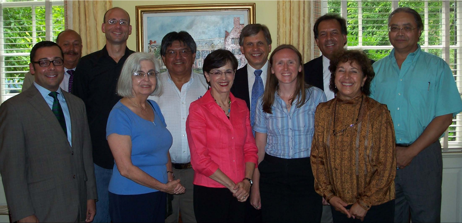
Photo taken at meeting hosted by the NC American Indian Health Board