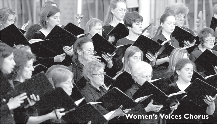
Women’s Voices Chorus

SUNDAY, JAN 25 Zen Meditation Workshop — Instruction will include walking meditation, awareness of the breath and how to practice with the mind,