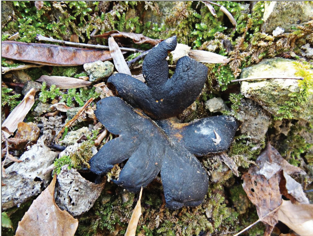
Finding an earthstar on a woods walk is special.