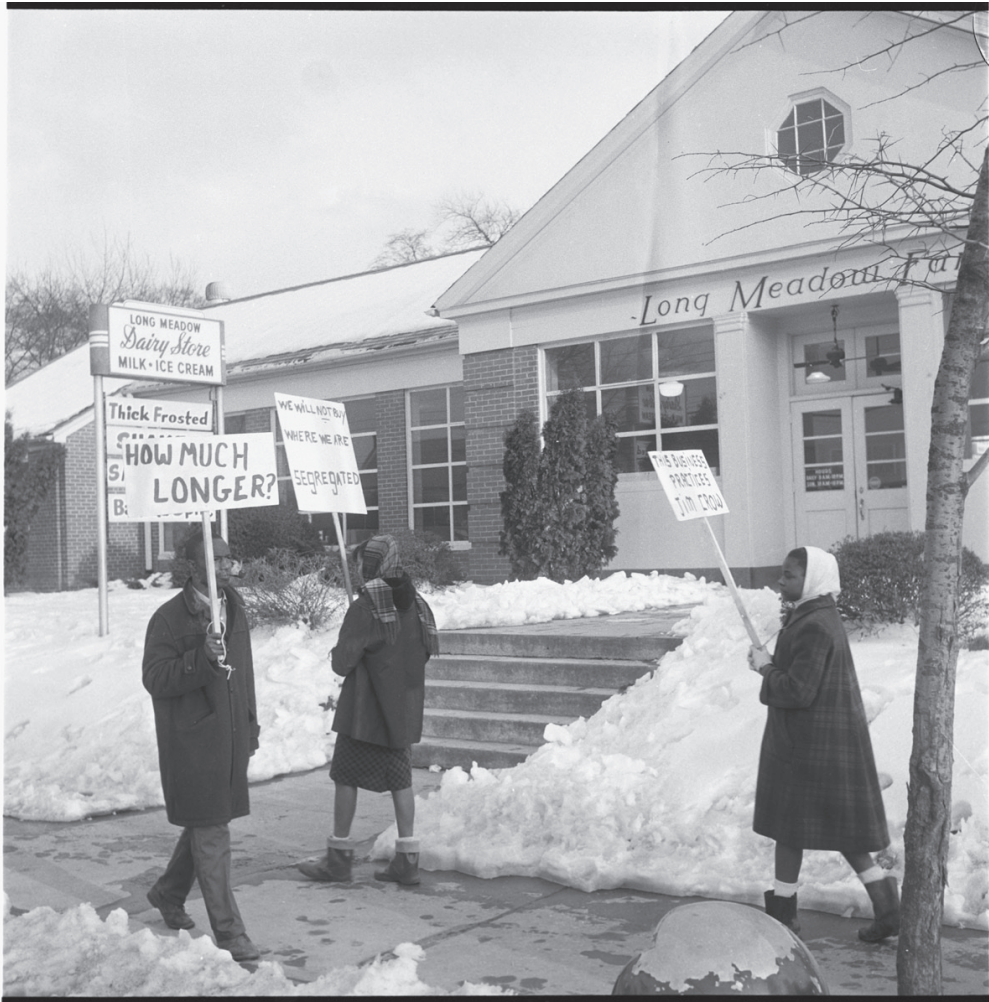
Picketing the Dairy Bar, 1963