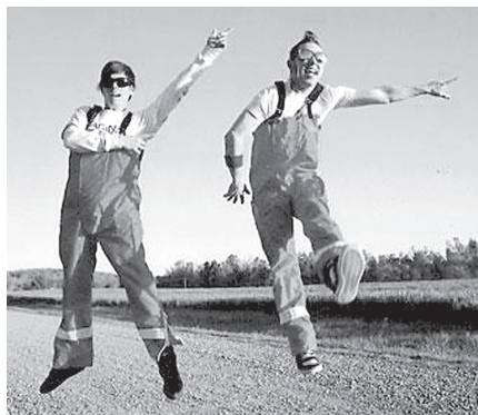
ROBOSAPIEN 1/12 LOCAL 506