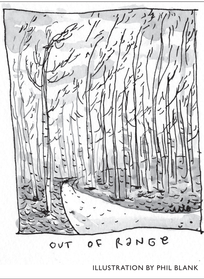
ILLUSTRATION BY PHIL BLANK

Compassionate Friends — Free self-help support for all adults grieving the loss of a child or sibling. Evergreen United Methodist Church, third Mondays 7-8:30pm 967-3221 chapelhilltcf.org