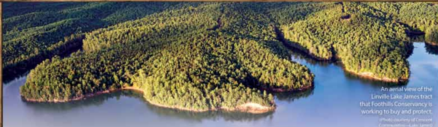
An aerial view of the Linville Lake James tract that Foothills Conservancy is working to buy and protect.