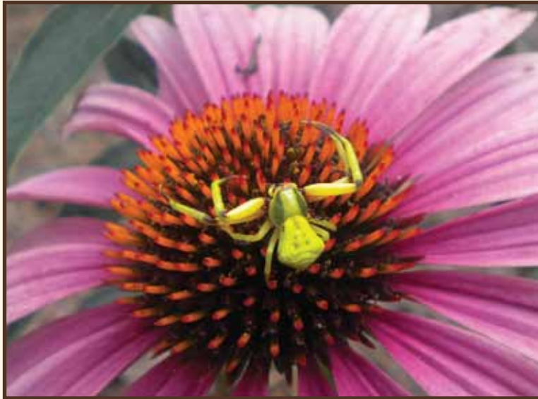
Red-banded Crab Spider - Misumenoides formosipes

Different than traditional web-building spiders, crab spiders do not use webs to entrap their prey. They use camouflage to hide among flowers in wait of their prey. Crab spiders are often colored to blend in with the whites and yellows of many species of flowers that serve as hunting platforms. Camouflaged against the flower petals, crab spiders lay in wait as various pollinators fly up to feed on the blossoms. As prey