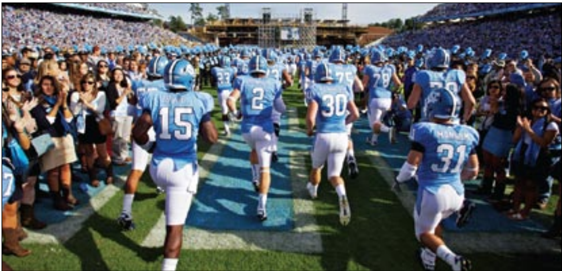
The Tar Heels walk onto the field at Kenan Stadium during the homecoming game against William and Mary.