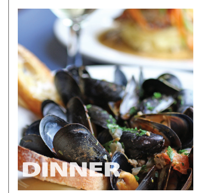
Panzanella is part of Weaver Street Market Cooperative