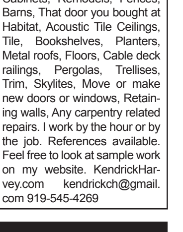
PLACE YOUR AD carrborocitizen.com/classifieds