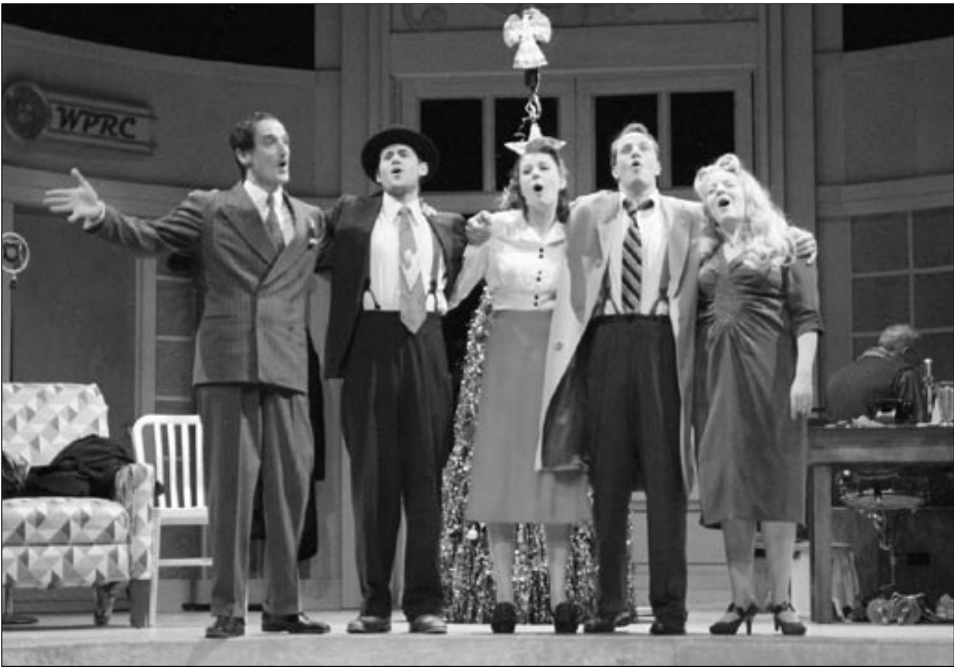
The cast of “It’s A Wonderful Life: A Live Radio Play” closes the Tuesday dress rehearsal performance by singing the ballad “Auld Lang Syne.”