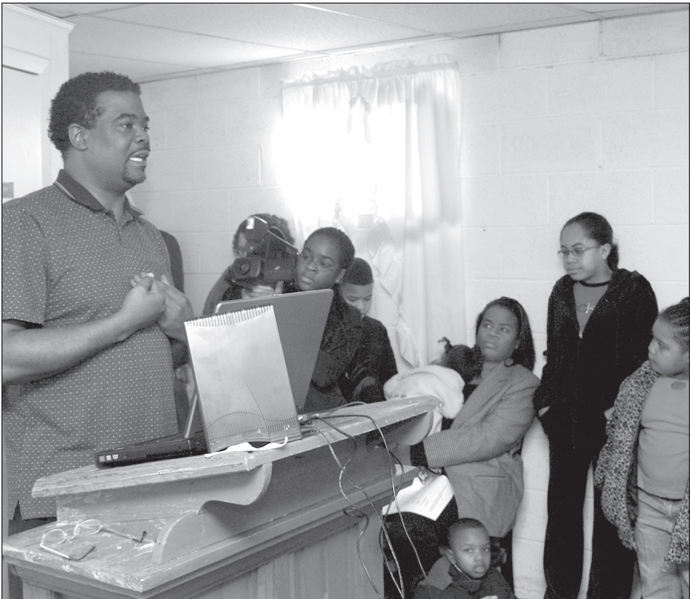
Parents and students get a first hand look at new computers and equipment installed upstairs at Barbee Chapel Church as part of the church's effort to provide after school support with lessons. The new program was initiated after concerns about progress on closing the achievement gap.

Friday — Chicken Patty Sandwich w/ Cheese; BBQ Pork on a Roll; Baked Sweet Potato; Coleslaw; Fruited Gelatin Monday — Spaghetti & Meat Sauce w/ Garlic Bread; Hot Dog on a Bun; Mixed Vegetables; Chilled Pineapple; Fresh Orange Tuesday — Salisbury Steak w/ Gravy and Wheat Roll; Fishwich; Sweet Yellow Corn; Tossed Salad w/ Dressing; Chilled Pears Wednesday — Vegetarian Lasagna w/ Wheat Roll; Chicken Nuggest w/ BBQ Sauce and Wheat Roll; Green Beans; Chilled Fruit Cocktail Thursday — Fried Chicken w/ Wheat Roll; Grilled Cheese Sandwich; Tater Tots; Garden Peas; Chilled Peaches Info: 967-8211 ext. 270