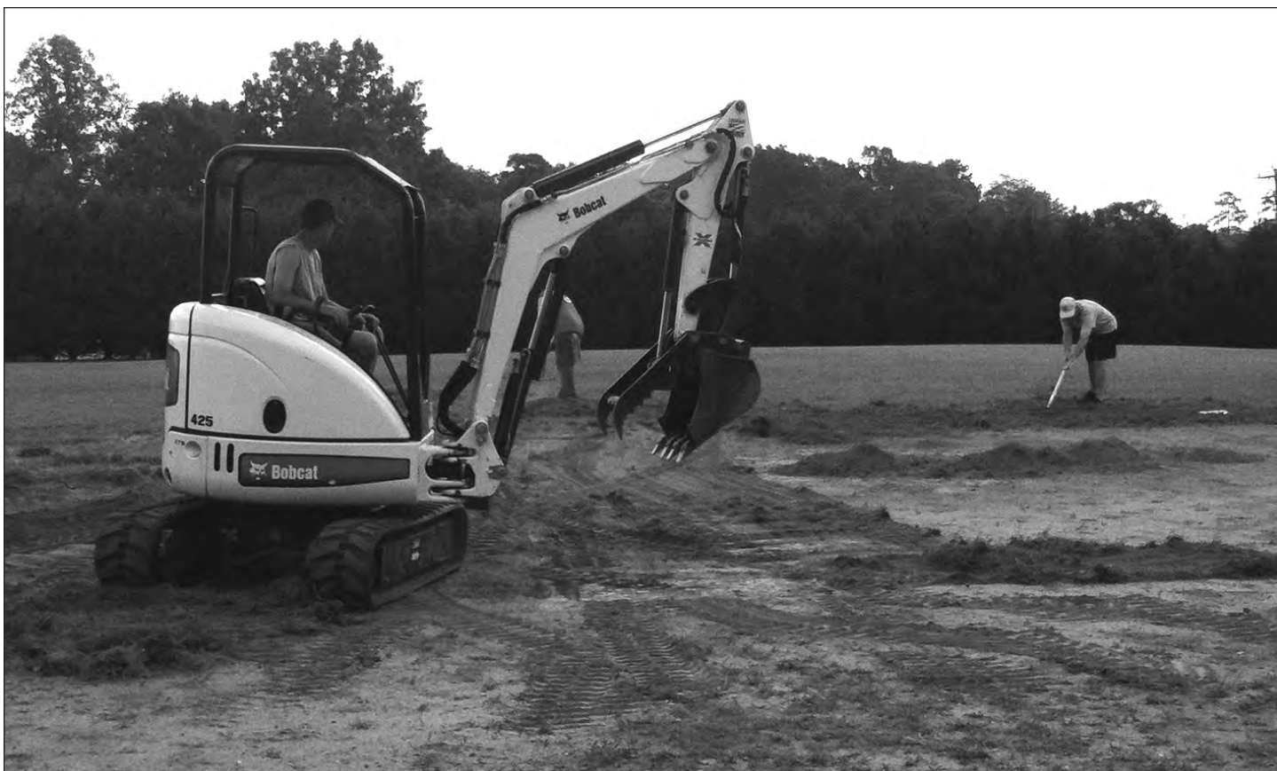
The CCM Sports Bombers worked on our ball field and used it for baseball practice. We were glad they put our field to good use.