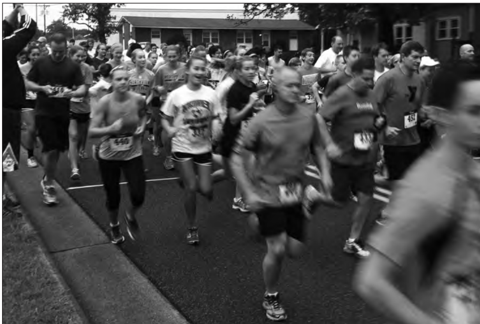
The Mt. Olive Lutheran Church held a 5K Fun Run in September with approximately 200 runners participating. Proceeds benefitted several local charities, including Sipe's.