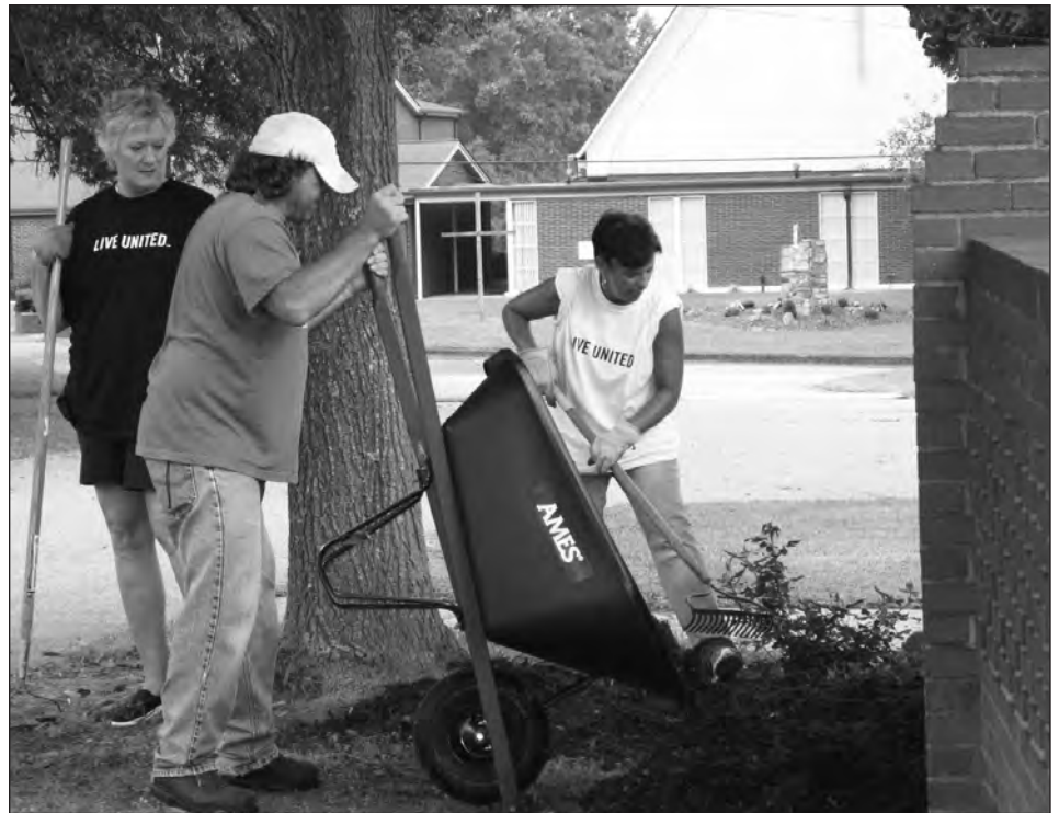
Many volunteers across Catawba County participated in the United Way's 2014 Day of Caring. One group came to Sipe's and completed numerous outdoor projects.