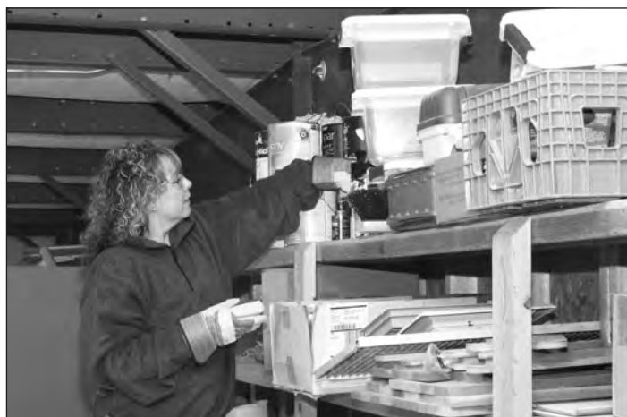
A jolly and enthusiastic group of 33 volunteers from Corning kicked off the 2015 volunteer projects at Sipe's with a bang. They scraped, painted, sorted, cleaned, hauled, and otherwise worked to accomplish a huge amount of work.