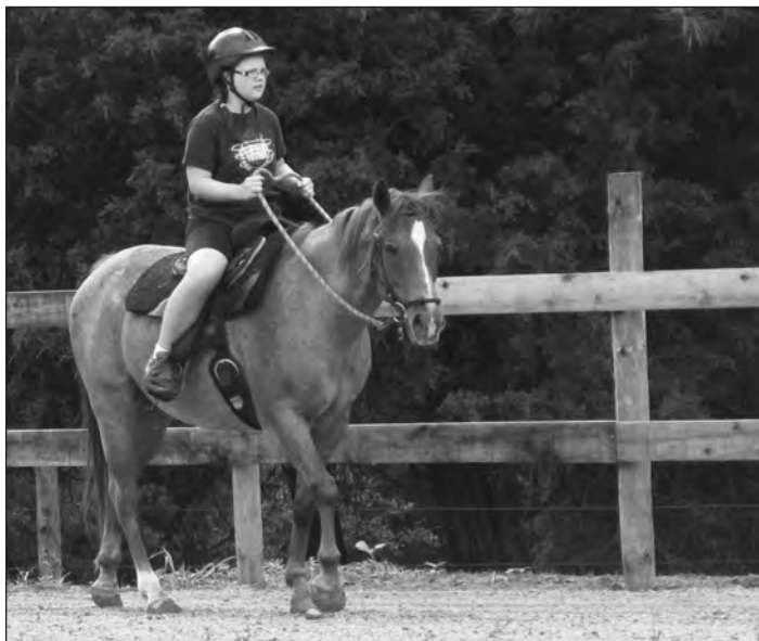
Everyone enjoyed horses again this summer.

Camp offered weekly themes this year, presenting campers with games, challenges, and other activities based around current interests. Two of the most popular borrowed from the reality shows The Amazing Race and Survivor . Both of these weeks encouraged campers to work together in teams and to explore different cultures, try new foods, and stretch themselves both physically and mentally.