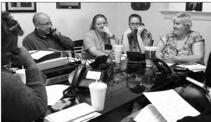
A new telephone system came to Sipe's in 2014. Here, the staff are learning to use it.

We focused on restoration in 2014. This annual report offers a glimpse at what we did last year to restore our buildings, grounds, and programs, as well as children's hopes, dreams, and lives. Of course, our great staff, committed board, and supportive community all together make it possible for us to continue helping children grow and flourish.