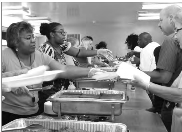
One of the traditions of summer camp is a July picnic, enjoyed by the campers, their families, and the Sipe's staff.

Summer Camp Open House March 28, 2015 2:00-4:00 p.m. See the Campus • Register for Camp