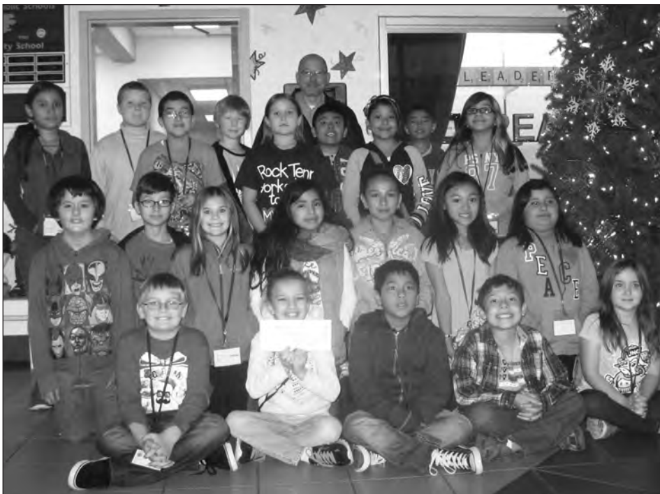
Two of the fourth grade classes at St. Stevens Elementary School recycled and sold lollipops to raise $664 for Sipe's.