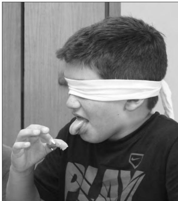
In one activity, campers were blindfolded and challenged to identify common foods. Reactions varied widely, to say the least.