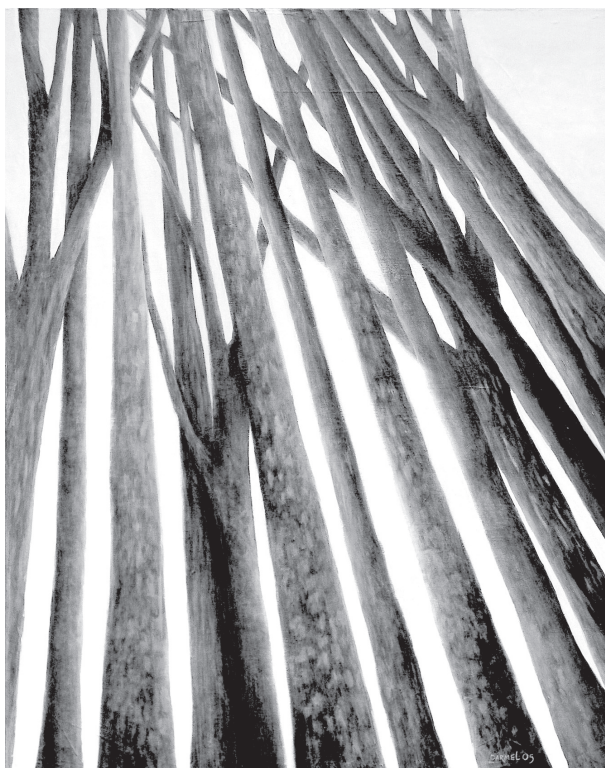
LINDA CARMEL – "CAROLINA CATHEDRAL" PART OF "WINTER BLUES" AT THE HILLSBOROUGH GALLERY OF ARTS