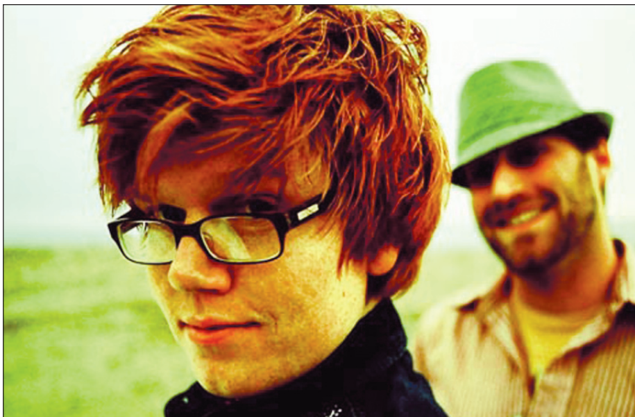
BRETT DENNEN 2/5 CAT'S CRADLE