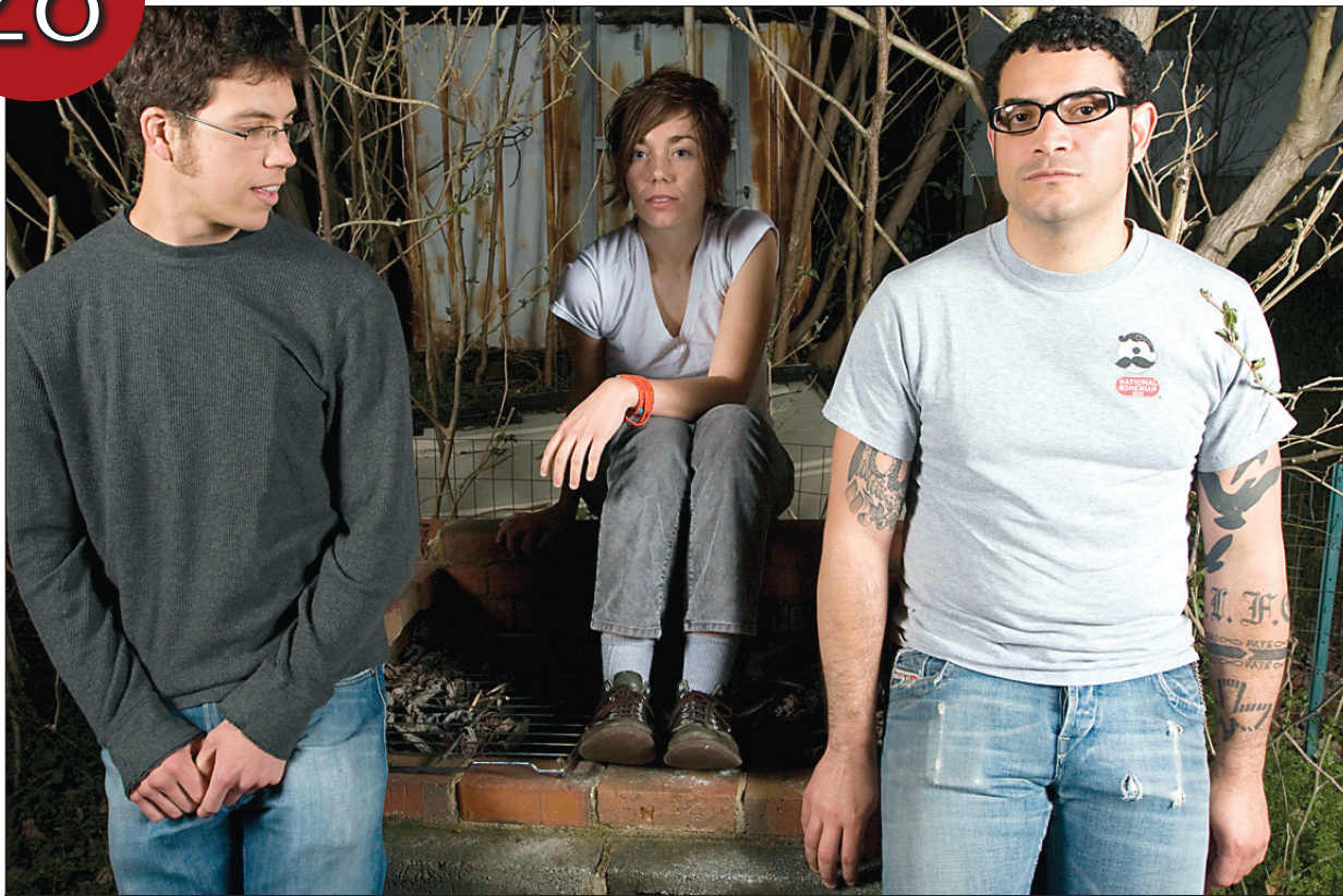
BELLAFÉA 2/7 NIGHTLIGHT