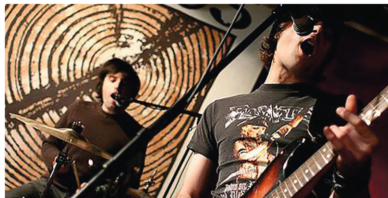
THE HOWLIES 2/2 LOCAL 506