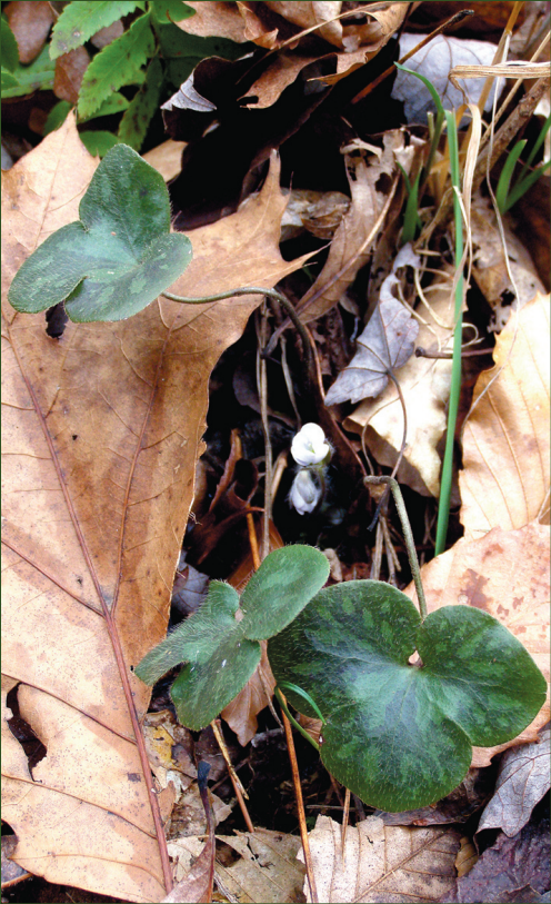
Flower buds of liverleaf signal spring's early emergence in the dead of winter.